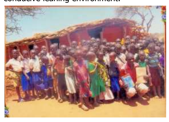
Today: Children at a rural school located in the neighborwood of Mkata

Reduced and later eliminate the high number of illiterates in rural areas, especially in girl child where early marriages and early pregnancies have proved a great risk to their lives because of lack of knowledge hence, creating generational extended poverty in societies. This can be achieved through accessing rural communities with good, motivational and conducive leaning environment.