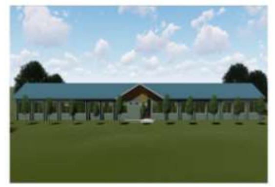
Future: Proposed classroom for 'Archangel Gabriel' High School Mkata