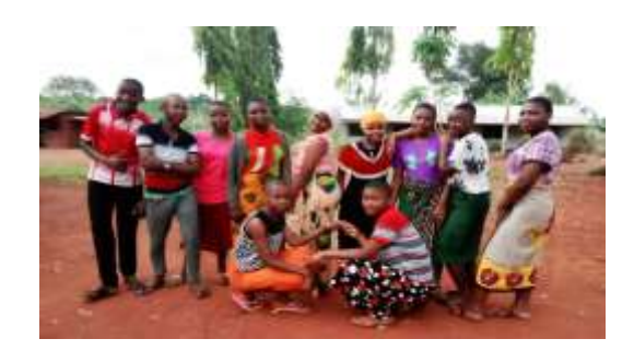
A group Photo for village Girls and Boys yawning for quality education

It will a mixed school (girls and boys) but emphasis put on girl child, to the fact that mothers are strong pillars of national Development, also not forgetting other vulnerable groups like, the disabled and orphans.