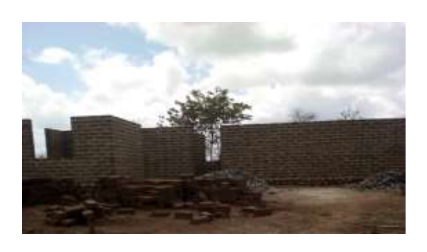
Ongoing Construction of mobilization Centre for green concrete technology Research

With the help of well-wishers and friends from local and international levels, we are on a forefront to construct a model secondary school with well furnished boarding facilities and classrooms, favorable and with conductive learning environment where special technologies are be applied for example, use of - Green concrete technology which is environmentally and economically friendly, - Biological treated Toilets for long term and good hygienic environment, - Solar Power' alternative, which is dependable, where long lasting panels are to be installed.