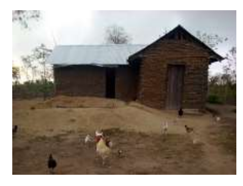
Experimentary Chicken Project for students and Historical House

Practical teaching enables students to acquire necessary elementary skills which can mentor them into highly skilled personnel and also helps to discover their hidden God given talents, hence producing directly beneficial candidates to national Development.